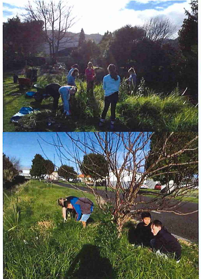
Room 5 Riverbank Weeding

Cross Country this term Remember to bring running Shoes