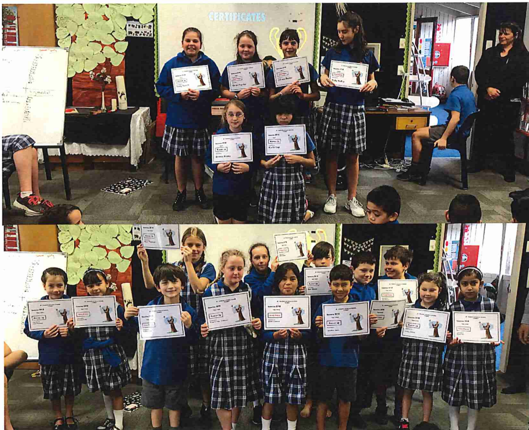
Room 3 and Room 5 speech winners